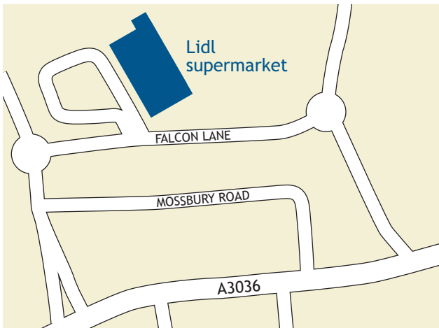
Lidl, Clapham Junction Falcon Lane, SW11 2PE